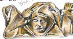
WHAT IS SHE THINKING?

THROUGHOUT THE BUILDING THERE ARE VARIOUS PIECES OF UNRESSED STONEMWORK. THESE ROUGH-HEWN BLOCKS OF STONE HAVE BEEN LEFT DELIBERATELY UNFINISHED AS A REMINDER THAT THE WORK OF GOD IS NEVER FINISHED.