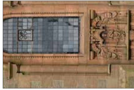
4. Brechin Coat of Arms