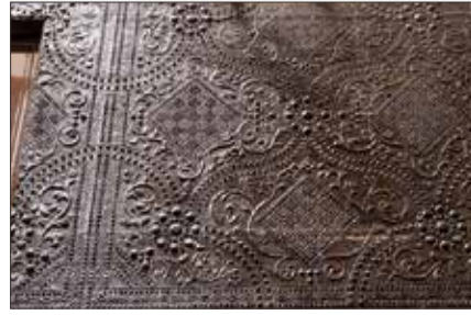
3. Tynecastle Tapestry Doors