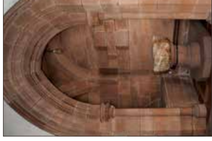
12. Marble Font