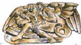
THE DEVIL HOLDS HIS EARS ... WHY?