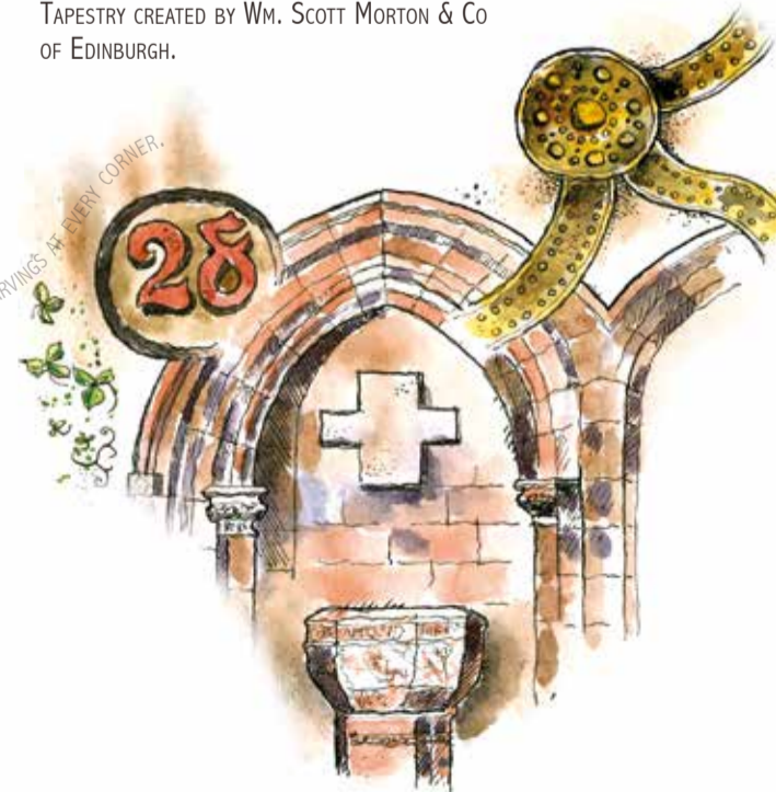
DETAILED STONE CARVINGS IN EVERY CORNER.

NOT ONLY ARE THERE IMPRESSIVE CARVINGS THROUGHOUT THE BUILDING, BUT THE DOORS ARE ALSO WORTHY OF A CLOSER INSPECTION. WHILST AT FIRST GLANCE, THEY MIGHT APPEAR TO BE COVERED WITH TOOLED LEATHER, IT IS IN FACT EQUALLY RARE TYNECASTLE TAPESTRY CREATED BY WM. SCOTT MORTON & CO OF EDINBURGH.