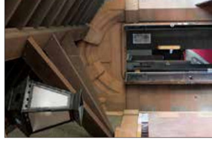
10. Cloister Doorway