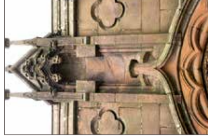
9. Empty Niche