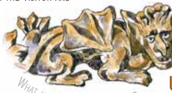
WHAT KIND OF CREATURE IS THIS?

THERE ARE OVER THIRTY FLORAL PATTERNS ROUND THE FRONT OF THE GALLERY. AND EIGHT ANGEL FACES AROUND THE PULPIT. SIXTEEN "CREATURES" DECORATE THE FRONT OF THE CHOIR PEWS INCLUDING A BEAR, A BUTTERFLY, AN OWL AND PERHAPS A DRAGON.