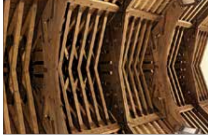
11. Scissor-braced Roof