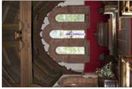
2. Chancel & Rood Beam