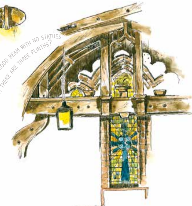
A ROOF BEAM WITH NO STATUES ... BUT THERE ARE THREE PLINTHS?

ALL ARE CONSTRUCTED WITH SQUAT PYRAMID-ROOFED TOWERS WITH MIXED ROMANESQUE AND LATE GOTHIC DETAIL. THEY WERE PERCEIVED TO BE LOWER COST, EASIER TO HEAT ALTERNATIVES TO THE TALL GOTHIC REVIVAL STYLE CHURCHES.